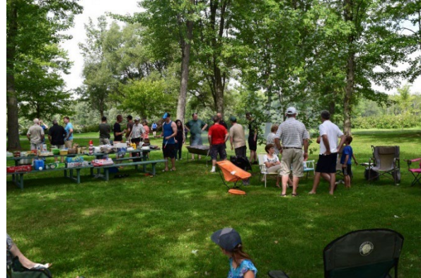
St. John's Lodge Picnic August 28, 2016