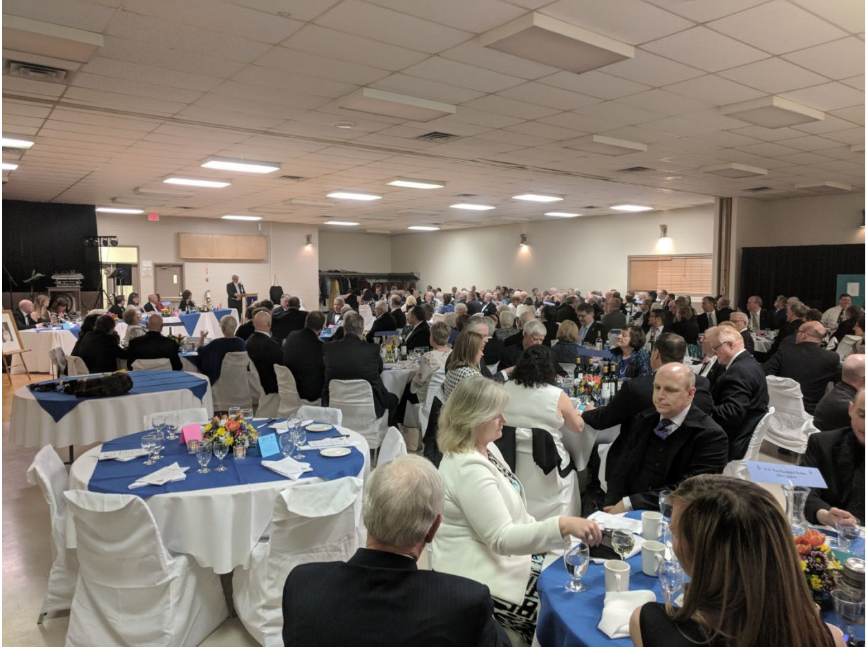
175 th Anniversary Gala Ball - April 10, 2018